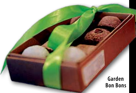
Garden Bon Bons