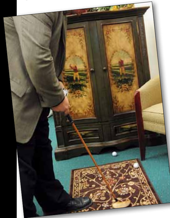
Antique Golfer's Armoire

For more great ideas please see GIFTS , page Life 2