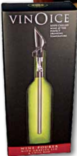
VinOice Wine Chiller