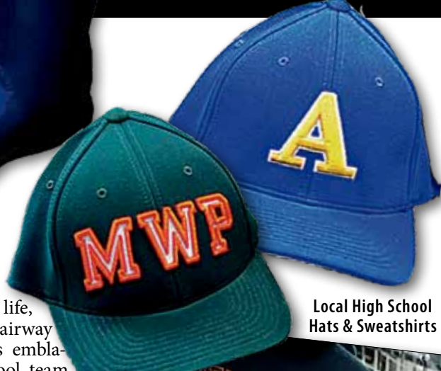
Local High School Hats & Sweatshirts