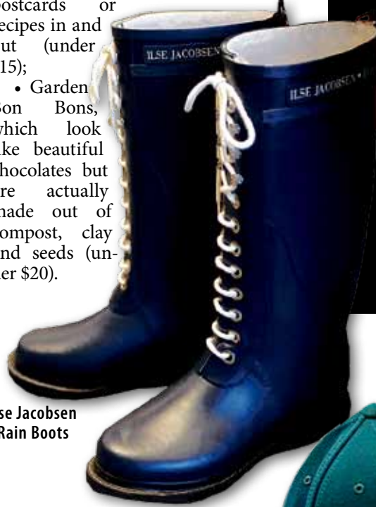
Ilse Jacobsen Rain Boots