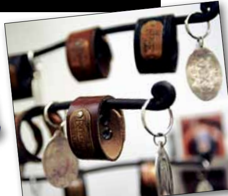
Junk Girls Handmade Bracelets & Key Chains